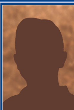
HE Student Governor